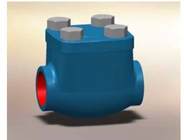
FIG : 442